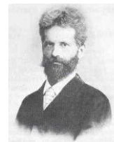
Haberlandt, G – Father of plant tissue culture

1902- Haberlandt, G – Father of plant tissue culture published a paper on "Experiments on the culture of isolated plant cells: In that he says "I should like to point out the fact that, in my cultures, despite the conspicuous growth of the cells which frequently occurred, cell division was never observed. It will be the problem of future culture experiments to discover the condition under which isolated cells undergo division". He clearly set forth the purposes and potentialities of cell culture after having attempted and failed in the culture of isolated plant cells. The reasons for his failure may be (i) use of three monocotyledonous genera for much of his work, (ii) culture of mature differentiated green mesophyll and pallisade tissues, (iii) contamination during culture growth.